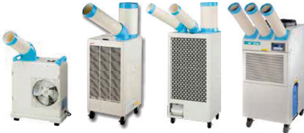
SAC-1800 (TL) Single Duct

Moving Spot Air Conditioner for Industrial Cooling in Factories, Car Workshops, Stores etc..