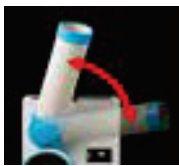
Auto - Swing Function