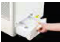
Compact drain tank