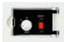
Control panel cover