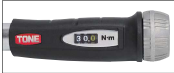
Visible Indicator (Patent and design are already registered.)