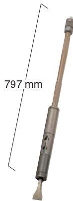
Model S-500 Non-CE