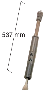
Model S-250 Non-CE