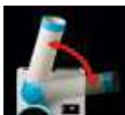
Auto - Swing Function