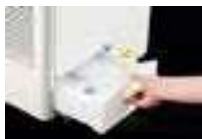
Compact drain tank