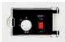
Control panel cover